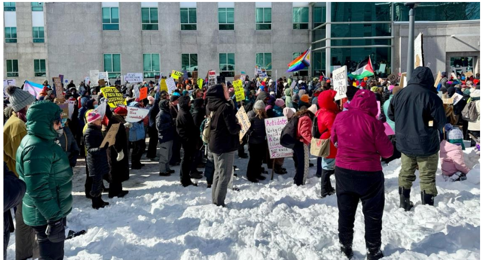
Taking part in the peaceful No Kings Demonstration at the Capitol on President's Day

Peaceful Heart Sangha is a mindfulness meditation community free and open to all. We practice stopping, calming, resting and healing which helps us to settle so that we can respond more skillfully to the challenges in our lives and in the world. The sangha was created at UUCU in 2001 and we donated the bell that is used to begin every UUCU service.