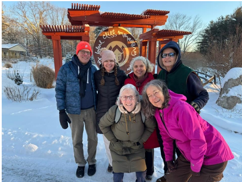
Some of the sangha members who visited Blue Cliff Monastery for Thich Nhat Hanh's Memorial on Martin Luther King Day weekend